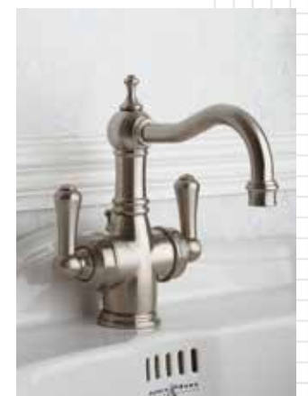
Above Country basin mixer with filtration, in Pewter, (H)23.5cm, £711.24, Perrin & Rowe