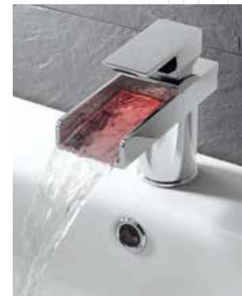
Above Water Square Lights monobloc basin mixer, (H)12cm, £875, Crosswater