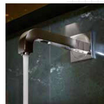
Above Axor Citterio electronic basin mixer, (H)22cm, £1,236, Hansgrohe